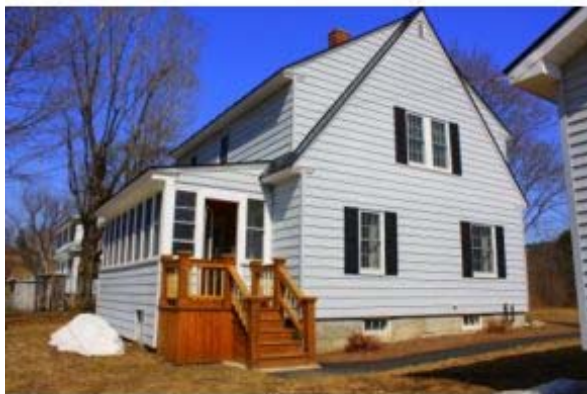
more pics on our website!