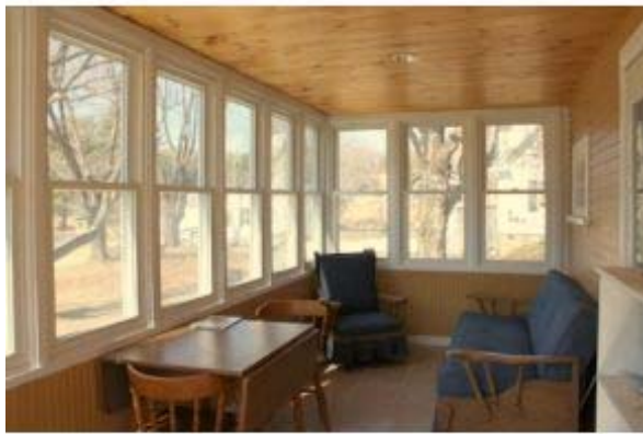
3 12 season porch