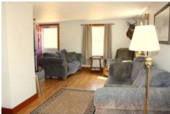
large living space