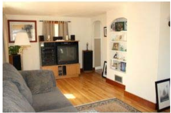
original built-ins and arches!