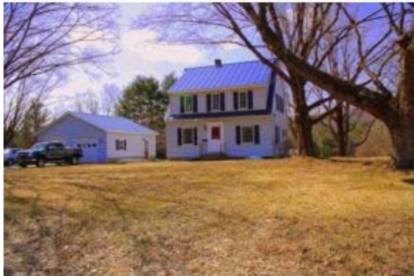
Remodeled Cape on 3.5 Acres