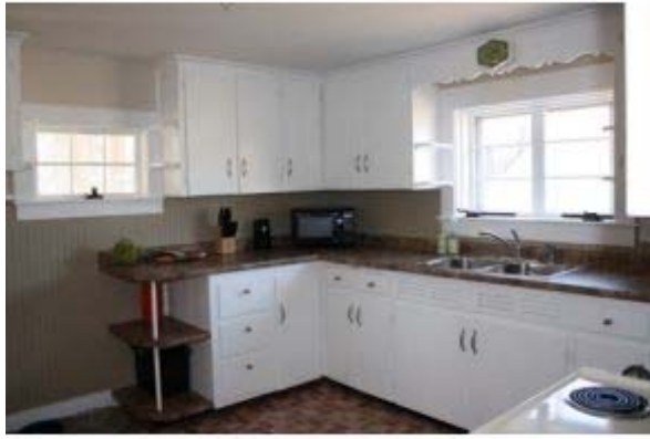
Kitchen just updated!