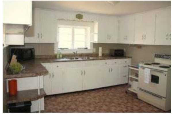
New counter tops sink

--- The REALTOR® supplying this Data Sheet makes no representation or warranty about the accuracy or completeness of the information contained herein. All information should be verified by any purchaser before entering into a purchase and sale contract for the property. --- © 2009 Vermont Real Estate Information Network Inc. 04/09/2009 09:32 AM